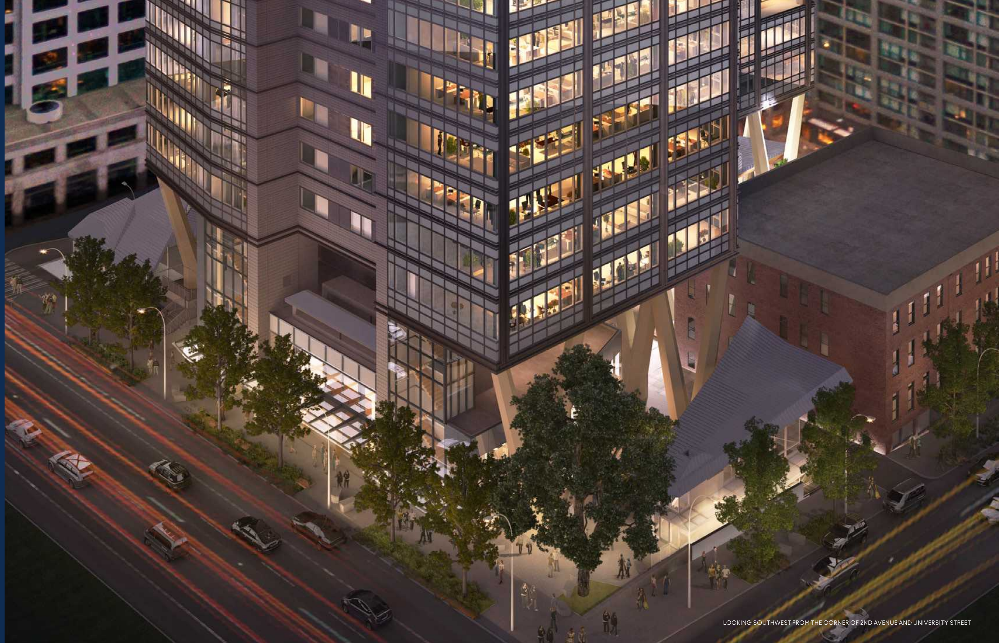
LOOKING SOUTHWEST FROM THE CORNER OF 2ND AVENUE AND UNIVERSITY STREET