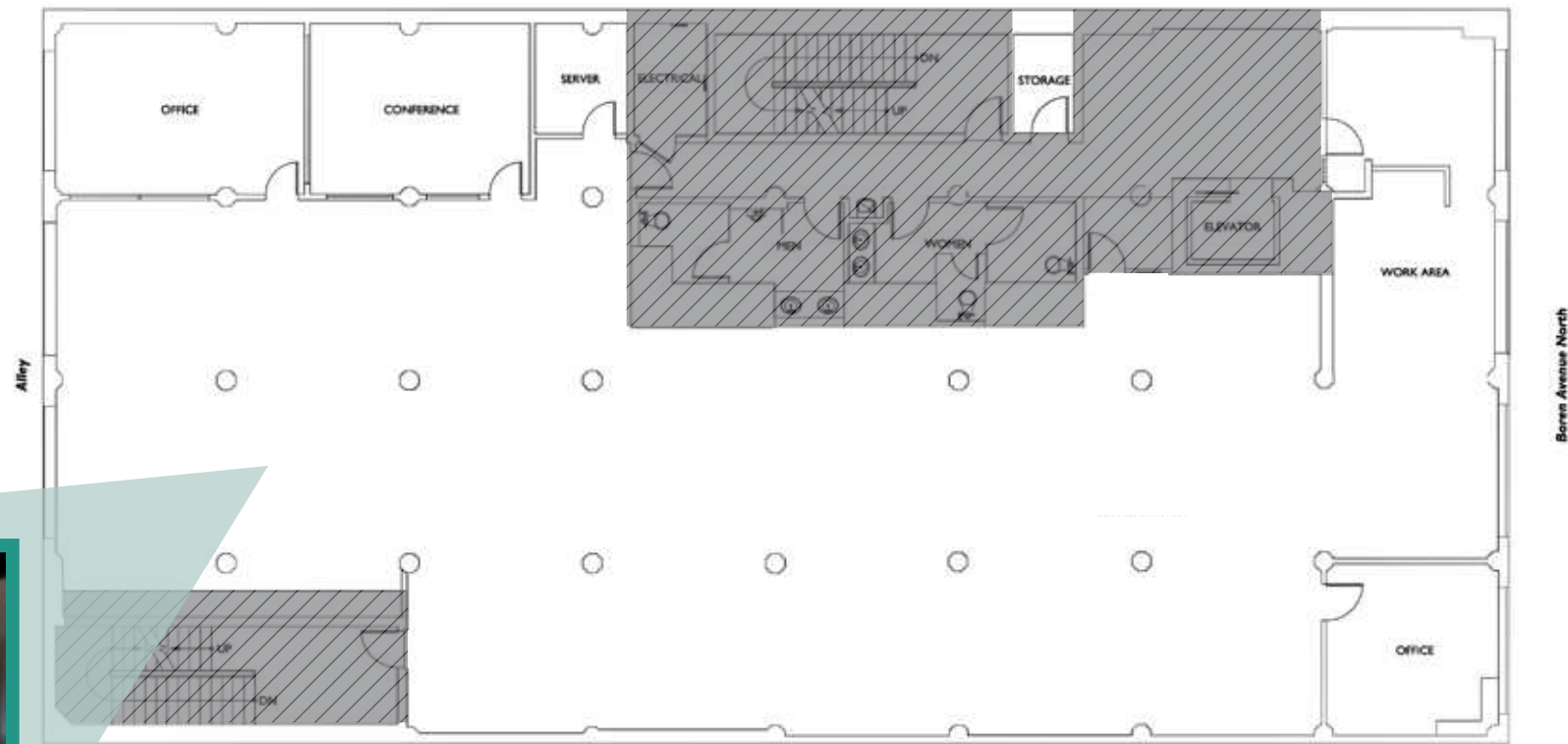
As-Built Floor Plan