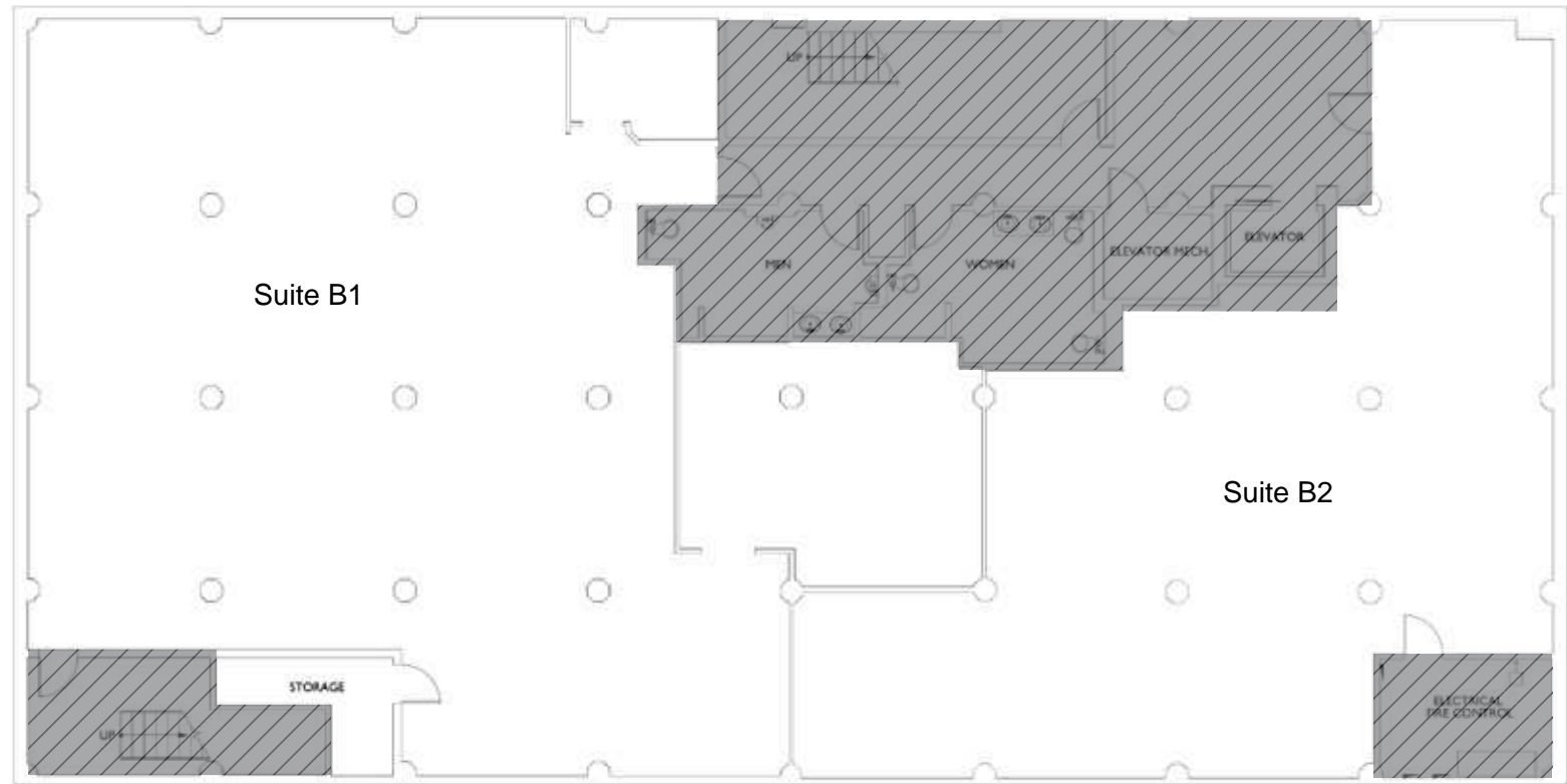
As-Built Floor Plan