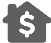
Average HH Income