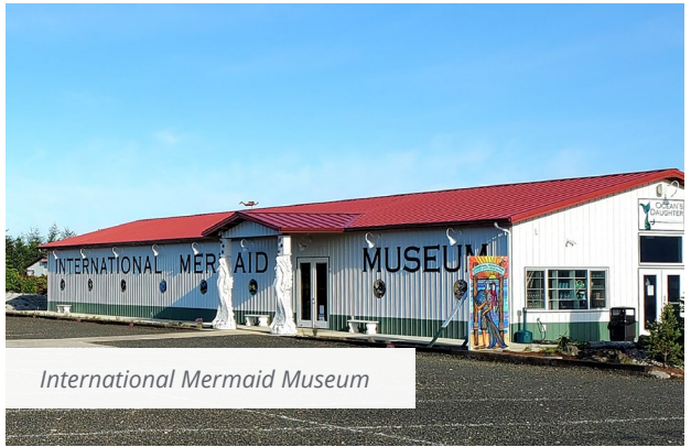
International Mermaid Museum